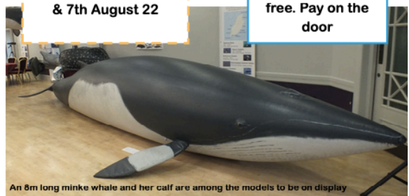
An 8m long minke whale and her calf are among the models to be on display

£5 cash donation for adults, kids go free. Pay on the door